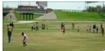
The search is on for the eggs