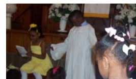
The Easter Present