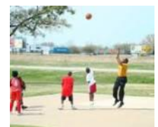
Pastor playing basketball in His church shoes