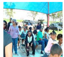
Big Crowd at the Easter Egg Hunt