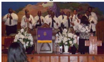
The Male Ministry Chorus